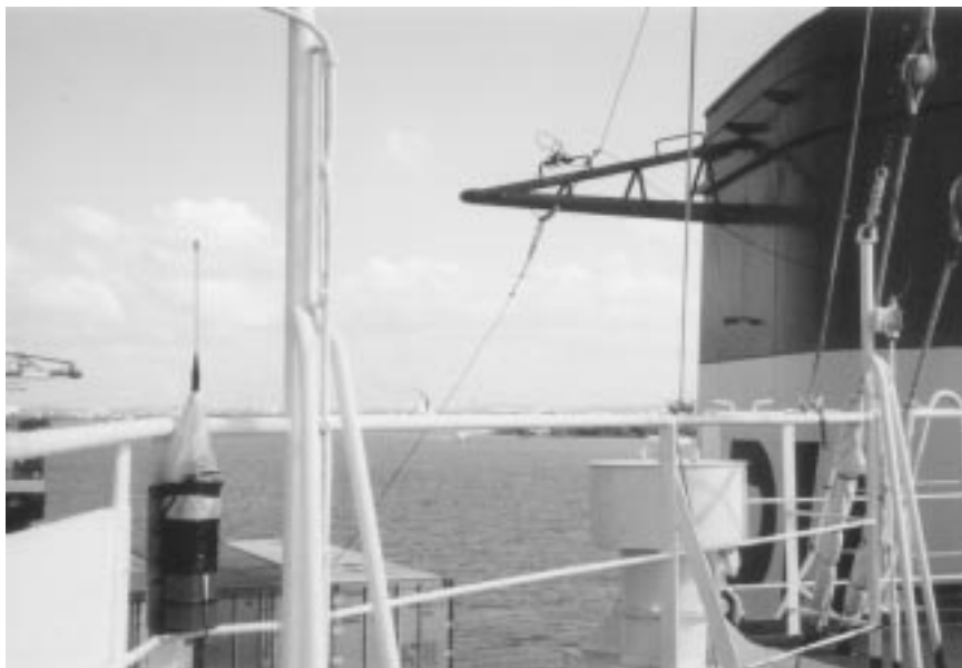
Fig 1: Test Beacon as seen mounted on the vessel “Kota Wijaya/9VHR”

The present Indian GEOLUT system, though experimental one, is supporting detection and distribution of 406 MHz alerts. Its full operational capability would be realized after commissioning of 2 nd generation GEOLUT system, which is to be operationalised before the launch of INSAT-3A and INSAT-3D.